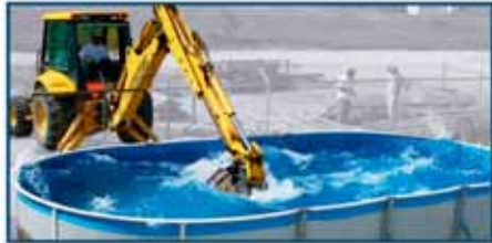
A vigorous backhoe test is performed prior to the launch of each new pool.

The Channel-Lok I Compact-Buttress System requires fewer angled supports (buttresses), yet provides an uncompromising level of strength. With fewer supports, space and side accessibility to the pool is increased while installation time is reduced. This is the only oval system with matching vertical supports. Unlike traditional buttress systems, the Channel-Lok I side verticals match the end verticals for eye-pleasing appeal.